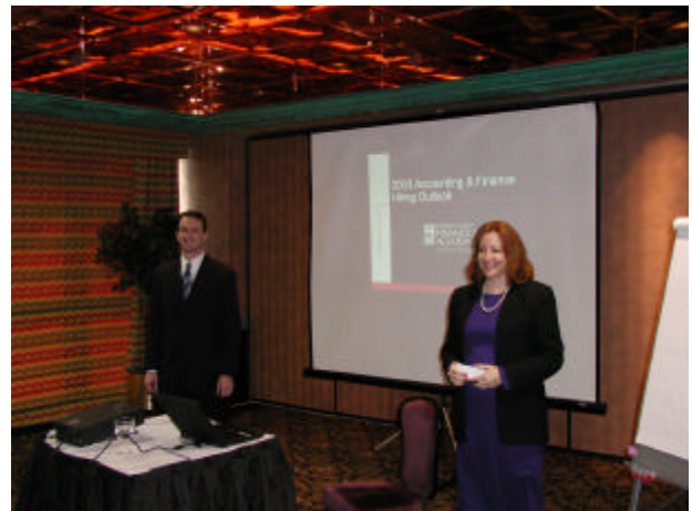
The speaking team from Robert Half returned this year.