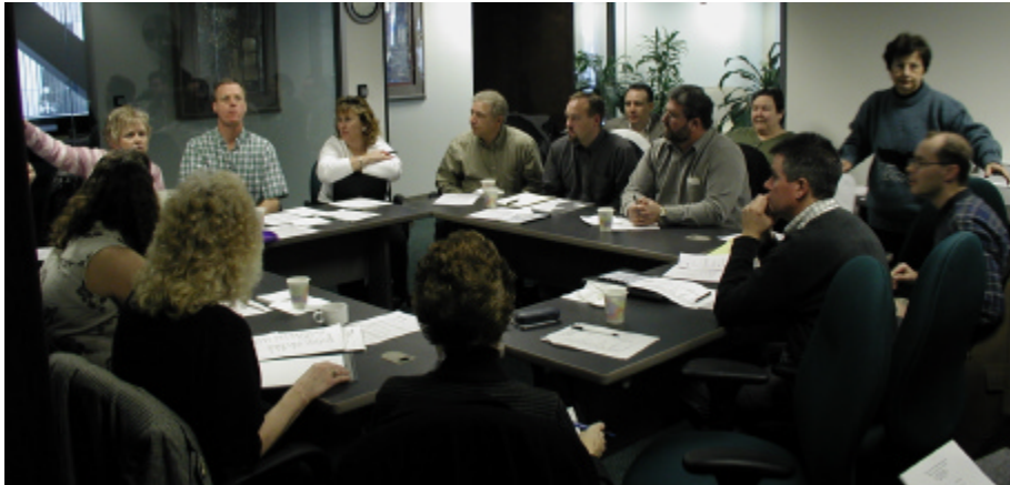
Your IMA Golden West Council Officers at the Walnut Creek Board meeting last February