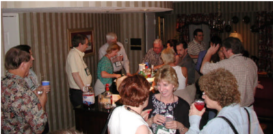
Golden West, Pacific Northwest, Wild West and Rocky Mountain joint hospitality suite in Nashville.